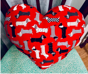
This pillow has a quilted front.

Therapeutic care for cardiac and breast cancer patients