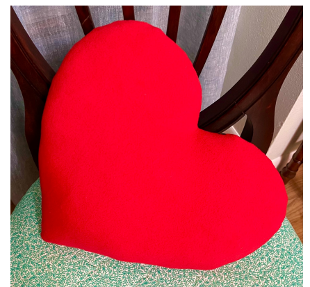
The back of the pillow is fleece.